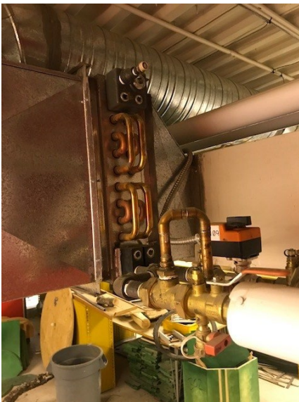
New coil and controls (Mount Sentinel)

Each year, the Board updates its Capital Plan that outlines various facilities and transportation initiatives to reduce the district's carbon footprint. We install LED lighting, upgrade building envelopes, replace or improve mechanical systems, all to reduce emissions. Building retrofits aim to reduce the district's carbon footprint, increase efficiencies, and reduce operating costs. The following building designs and retrofits were completed in 2023-2024: