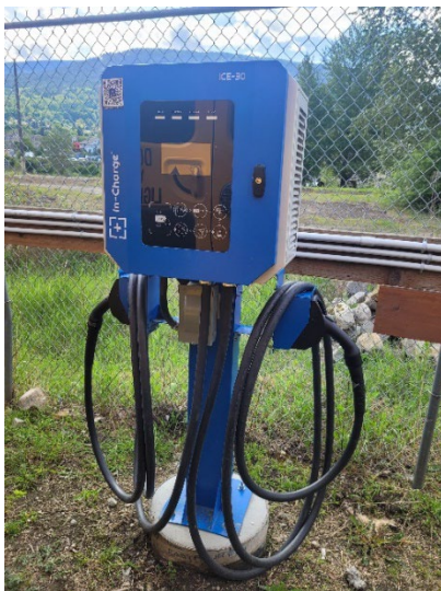
New charger (Nelson bus yard)

As fleet vehicles are replaced, the district plans to acquire EV, PHEV, or hybrid vehicles. The district is awaiting delivery of three new electric buses bringing our electric bus fleet to five.