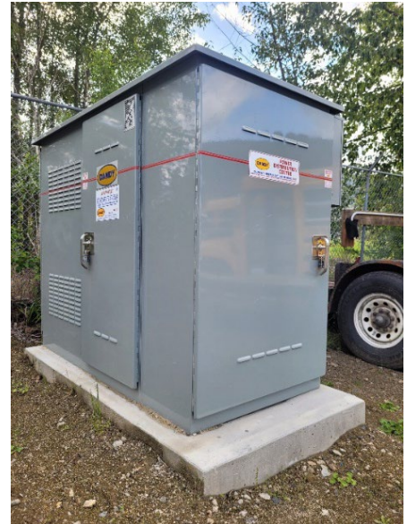
New charging kiosk (Nelson bus yard)