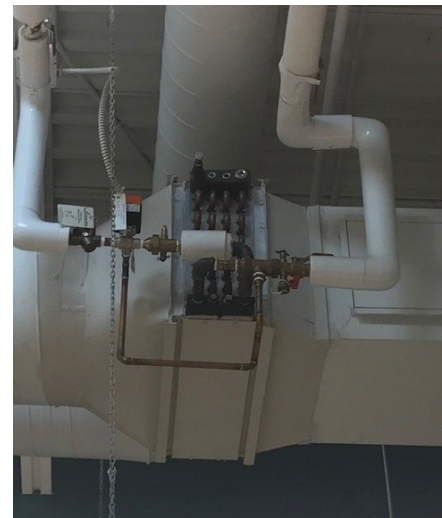
New coil and controls (Trafalgar)

By June 30, 2024, the School District No. 8 Kootenay Lake's final 2023 Climate Change Accountability Report will be posted to our website at www.sd8.bc.ca